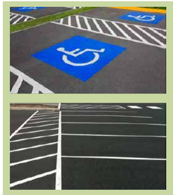
Figure 1.4. ADA Pavement Markings

The Americans with Disabilities Act (ADA) provides federal requirements for slopes, markings (Figure 1.4), clearances, and other features for accessible parking stalls. Such stalls should be designed and constructed per federal code and local requirements to ensure compliance.