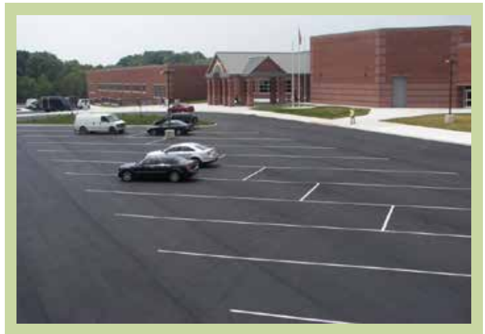
Figure 1.2. 45° Stalls

With limited paving real estate, 45° stalls (Figure 1.2) are sometimes preferred. The small change in angle also permits the use of narrower aisles. This angle further reduces the parking stall count.