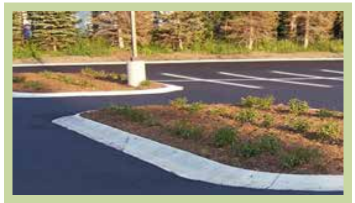
Figure 3.2. Parking lot curbs can be both functional and aesthetic.

Many parking facilities have some form of curbing within and around the perimeter for both functional and aesthetic reasons (Figure 3.2).