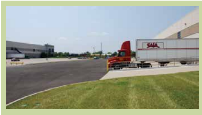
Figure 3.3. Truck Loading Area

Areas in and around truck loading docks (Figure 3.3) and trash dumpsters represent severe loading conditions for the pavement and should be carefully considered when designing the parking lot. Light duty pavement sections used in these areas can be prone to premature failures. A designer should take two factors into consideration: the location of the loading dock or dumpster, and the pavement thickness in that area.