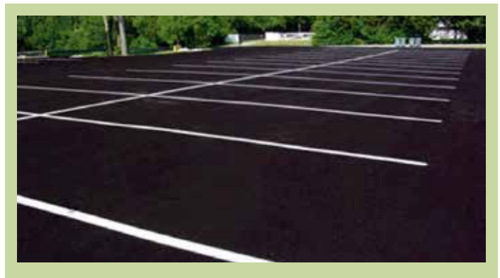
Figure 1.1. 90° Stalls

The 90° angle (Figure 1.1) achieves the highest parking stall capacity. This type of parking is more suited for all-day parking (such as employee parking) because it has the highest degree of difficulty for entering and leaving parking stalls. It is generally not preferred for “in and out” lots such as fast food restaurants and banks.